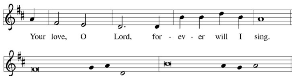
Psalm tone reproduced from Psalter for Worship Year C © 2006 Augsburg Fortress. May be reproduced by permission for local use only.

1 Your love, O LORD, forever 1 will I sing; from age to age my mouth will pro- 1 claim your faithfulness. 2 For I am persuaded that your steadfast love is estab- 1 lished forever;